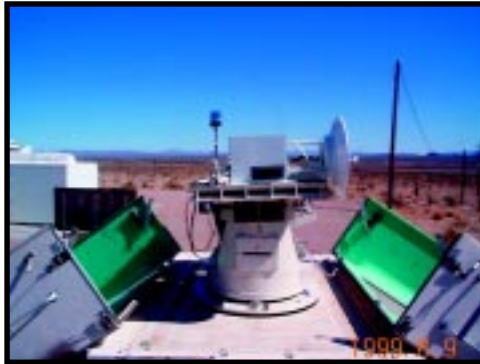
Range Only Radar on Optical Tracking Platform

components as well as test equipment and the ready availability of proven X-band modules in the commercial marine and aviation field, X-band was the more attractive alternative.